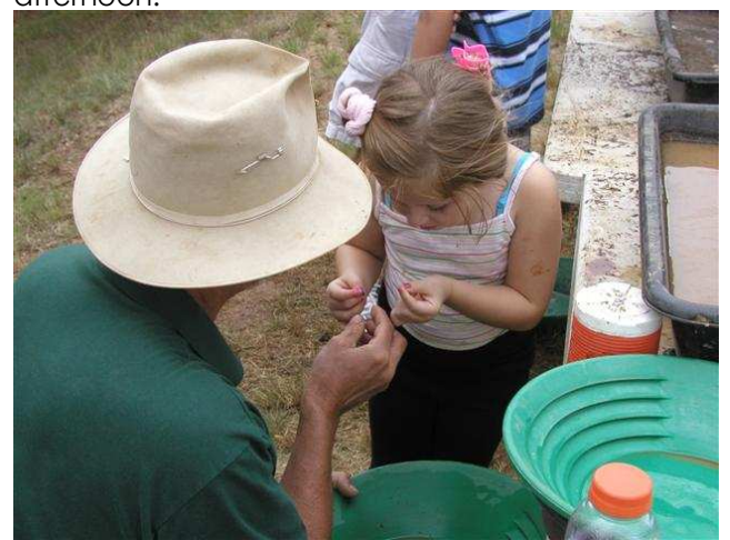
Young gold hunter looks for "color"

"Thank-you" to those who were able to come out and help at the Kentucky Camp annual meeting and open house on October 11th. The weather was a bit chilly and threatened rain most of the day. Despite the weather, we had a light (but steady) stream of visitors through the early afternoon.