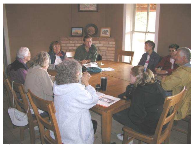
The annual meeting took place in the Administration building "parlor"