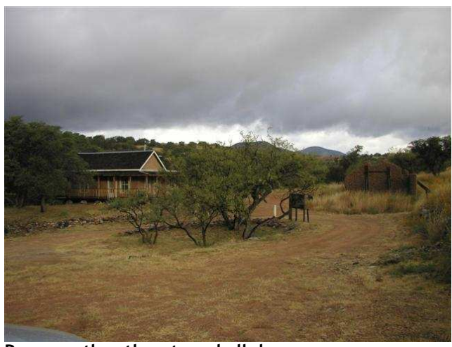
Poor weather threatened all day