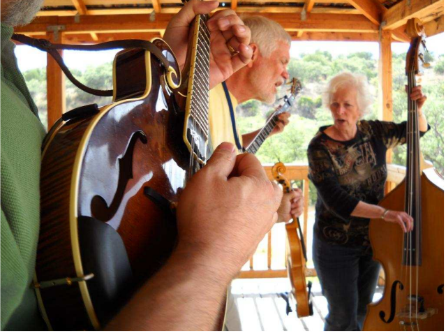
The Desert Bluegrass musicians were a big hit for the volunteers and guests. They provided period background music for much of the day.