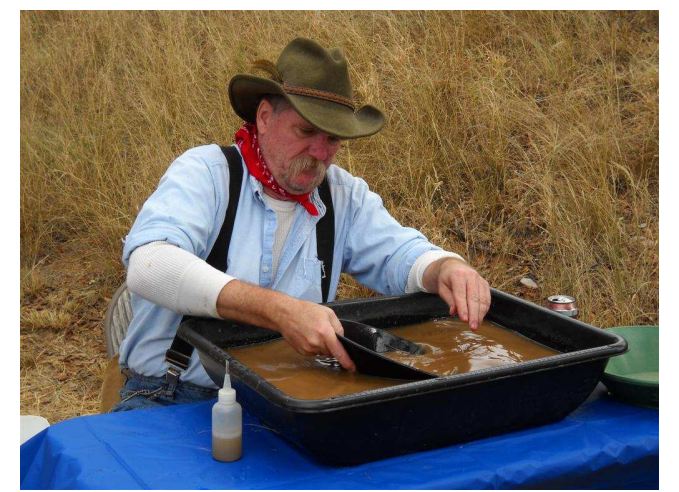
The Desert Gold Diggers were on hand to provide their always-popular gold panning demonstration.

The new approach for having guests bring a picnic lunch seemed to work out pretty well.