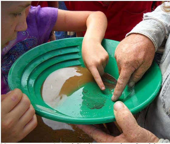
Youngsters enjoyed finding specks of gold.