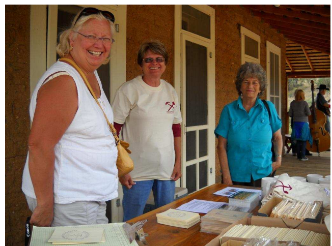
Guests appreciated the live Bluegrass music and supported our efforts with plenty of t-shirt, mug and card purchases.