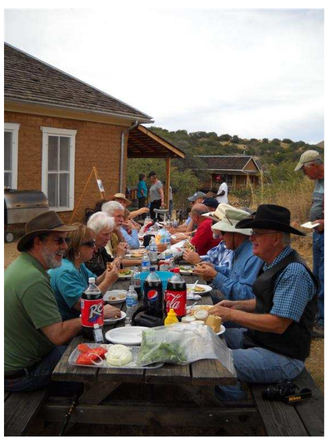
Everyone enjoyed the picnic-style lunch arrangements. Next year we may need more picnic tables!