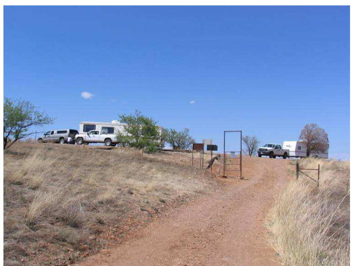
Old trailer (left) meets new trailer (right) at the top of hill