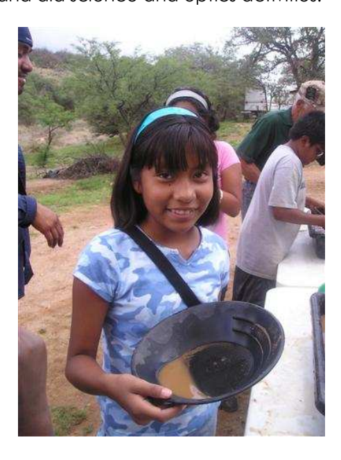
But kids will be kids – when asked what about their favorite thing during the week, many said "roasting marshmallows!"

The T'Jewedga camp would not have been such a success without the help of other partners. Club members from the Desert Gold Diggers showed the kids how to pan for gold. Biologists from the Sky Island Alliance and the U.S. Fish and Wildlife Service led talks, games, and demonstrations about wildlife and the environment. Patagonia Lake State Park welcomed the campers one morning, and when a big thunderstorm and flooding prevented the kids from returning to camp, the town of Sonoita provided shelter at the fairgrounds for the afternoon. The kids toured Kitt Peak National Observatory on their way back to Sells, and did science and optics activities.