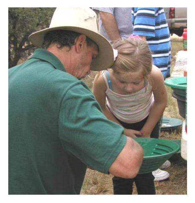
Young "prospector" looks for "color" at the gold panning demo. (From the 2008 open house)

http://www.fs.fed.us/r3/coronado/forest/heritage/kcamp/kcamp_rentals.shtml