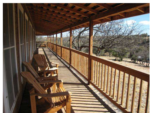
Headquarters building porch and chairs