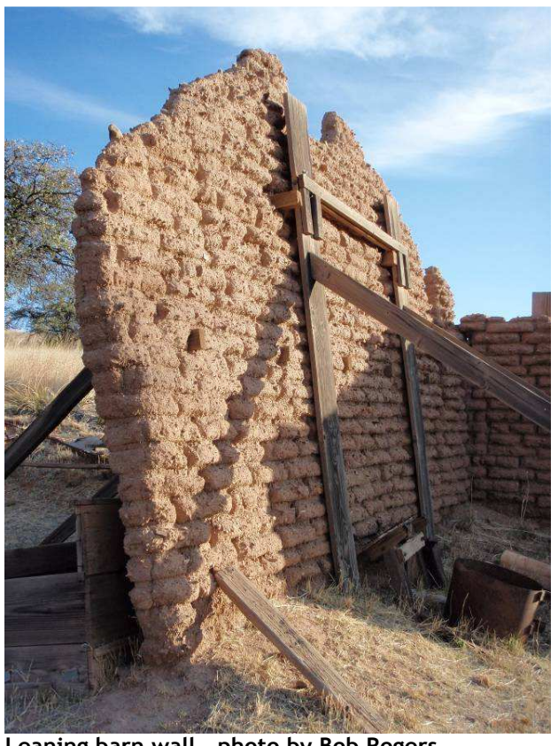
Leaning barn wall