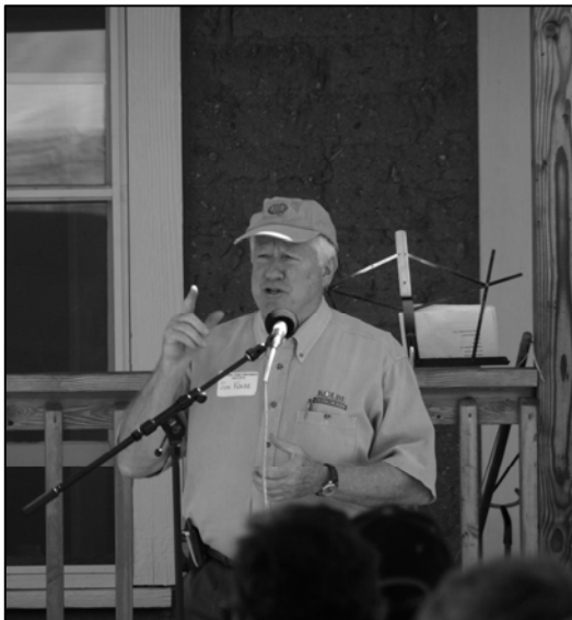
Jim Kolbe addresses the guests during lunch. Jim is the US Congressman for Arizona's eighth district.