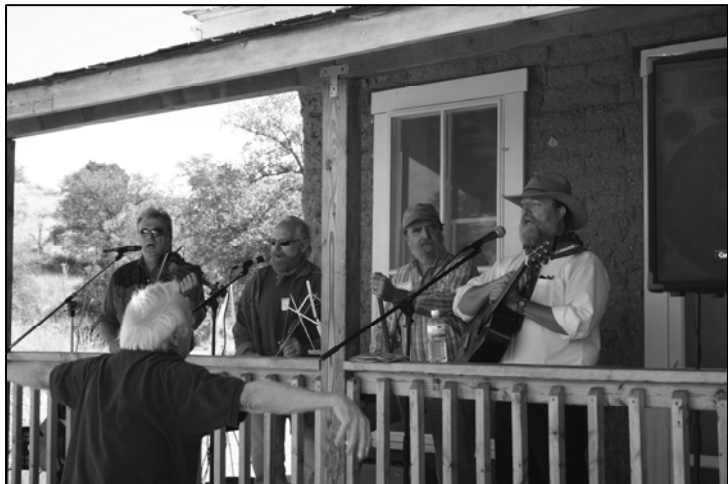
The Tortolita Gut Pluckers provided music for the event. They play a great mix of Blue Grass.... or is that "Brown Thorn"??!