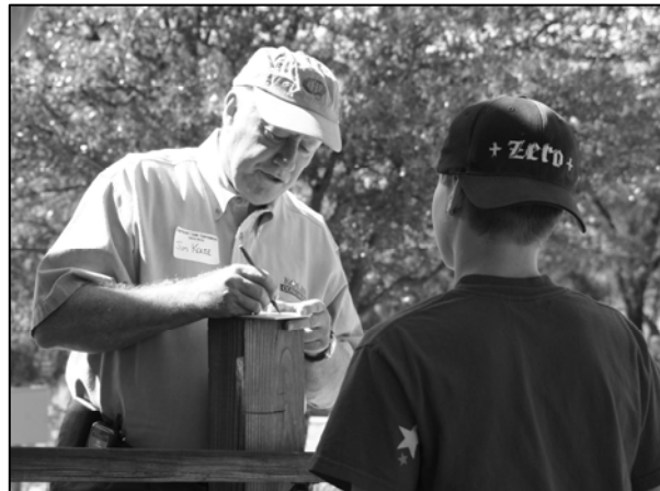
Congressman Jim Kolbe takes time to sign an autograph for one of the event's younger guests.