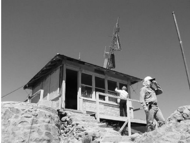
Atascosa Fire Lookout

Ranch has been part of a joint effort by the Forest Service and a local charter high school for the past three years. Students work on their Science and History coursework at the site two days each week, but on alternate Tuesdays they help work on preservation tasks, including lime plaster, adobe patching, and wood repair.