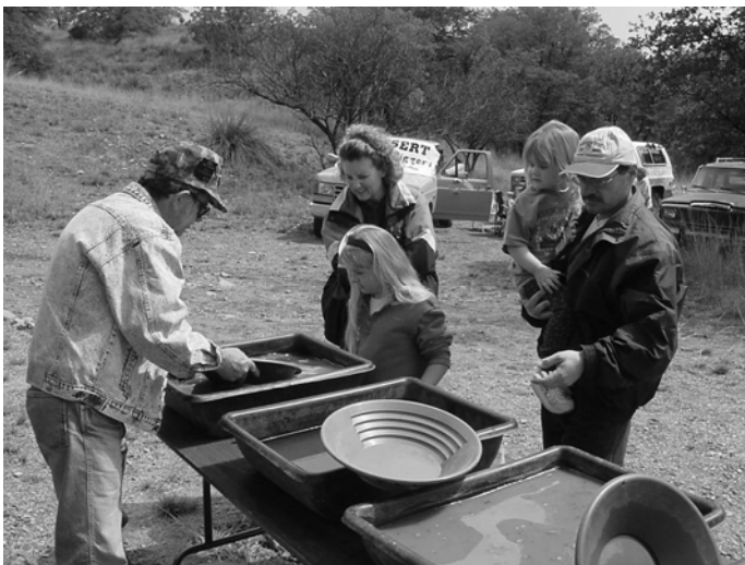
Gold Panning demonstration

Don't forget the annual Kentucky Camp open house being held in conjunction with the Coronado National Forest. The event takes place at Kentucky Camp on Saturday, March 12, 2005 from 10:00 a.m to 3:00 p.m. in conjunction with Arizona Archaeology Awareness Month. The event is free to the public and we are advertising in a number of area newspapers and internet outlets. Plan on attending and bring a friend.